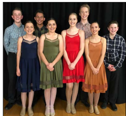
Ballroom Dancing Students